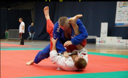
Grappling Gi JiuJitsu

https://www.youtube.com/watch?v=x5xJX7IIQq0