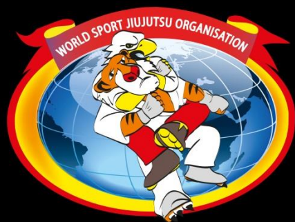
Sport JiuJitsu fighting