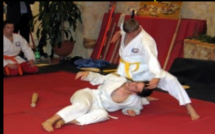
Realistic Self-defense JiuJitsu

https://www.youtube.com/watch?v=VZqwi7v52Jo